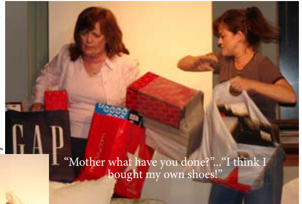
“Mother what have you done?...“I think I bought my own shoes!”