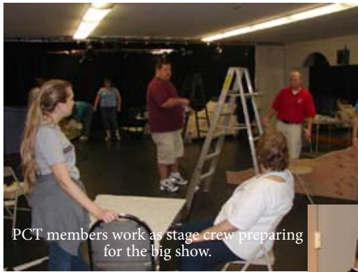
PCT members work as stage crew preparing for the big show.