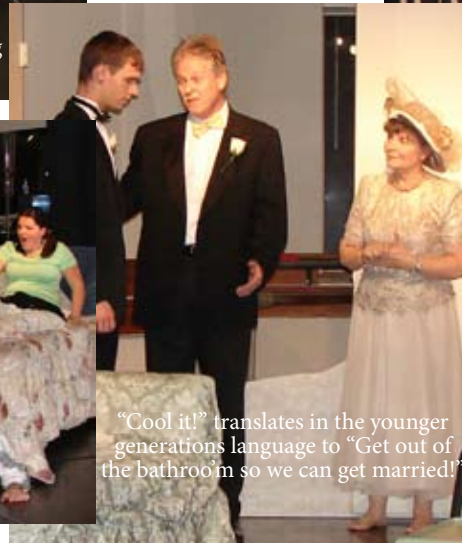
“Cool it!” translates in the younger generations language to “Get out of the bathroom so we can get married!”