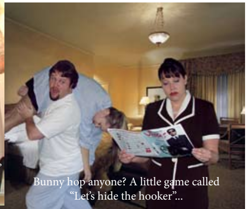
Bunny hop anyone? A little game called “Let’s hide the hooker”...

Placer Community Theater proudly presented Neil Simon’s “California Suite.”