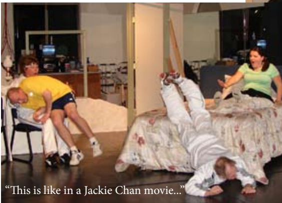
“This is like in a Jackie Chan movie...”