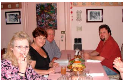
Mmm...taste testing at the Mansion

Look for Placer Community Theater in upcoming events at Power's Mansion Inn. The Board