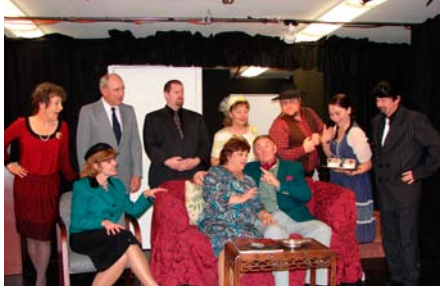
Cast of "Exit the Body"

Placer Community Theater's last production "Exit the Body" was a huge success, selling out the entire run of the show the